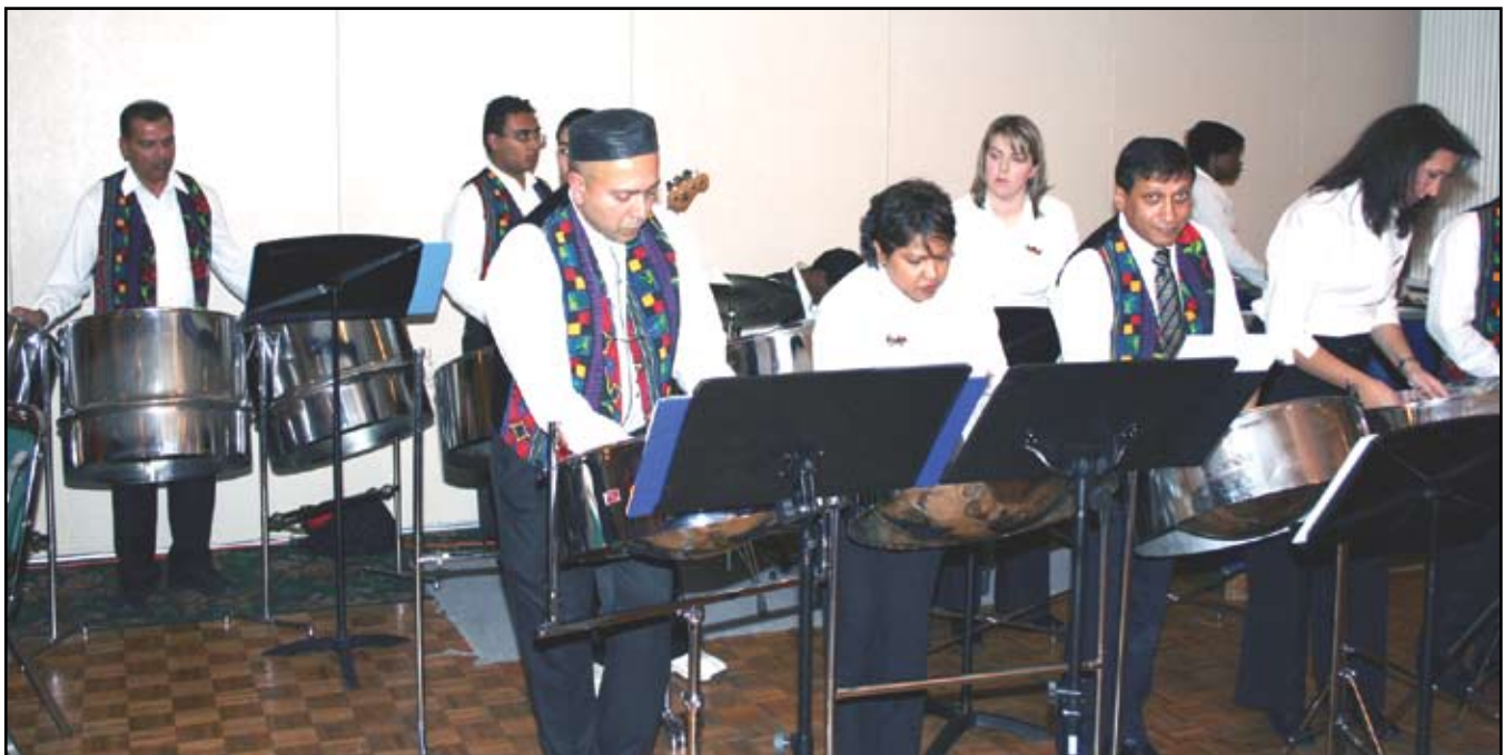
Panache's performance at XMAS Dinner & Dance, November 2005.