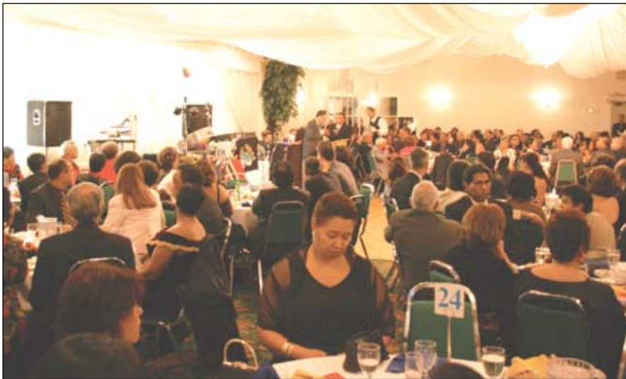
Christmas Dinner & Dance, November 26, 2005 at Elite Banquet Hall.