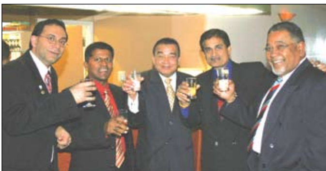
Who Let these Guys In?