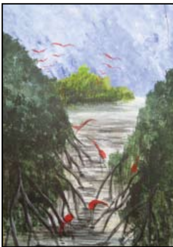
Original Oil Paintings by Ian Ali